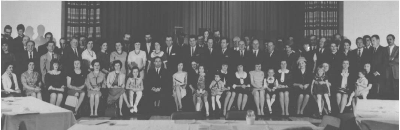
First Gathering 3 April 1965

themselves as Austrians of sorts, still continued to report themselves as such to Canadian census authorities for decades after 1918, and still proceed to join Austrian clubs to this day. Baffled Canadian immigration officials never did sort out these complexities. Some immigrants whom they could not readily categorize were lumped together under the heading "Austrians unless otherwise specified," while others were simply called "Germans."